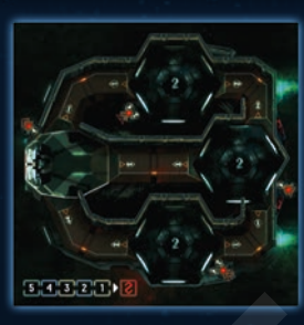
1 Shuttle Board