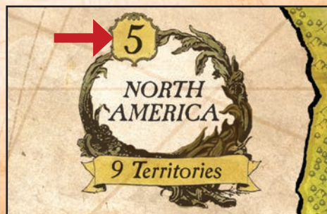
Continent bonus icon

You occupy 17 territories = you receive 5 new troops