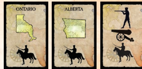
any 2 of the same troop design plus a "wild" card

The first set traded in = 4 troops The second set traded in = 6 troops The third set traded in = 8 troops The fourth set traded in = 10 troops The fifth set traded in = 12 troops The sixth set traded in = 15 troops