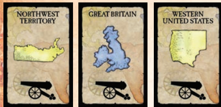
3 cards of the same troop design

You are trying to collect sets of three cards in any of the following combinations: