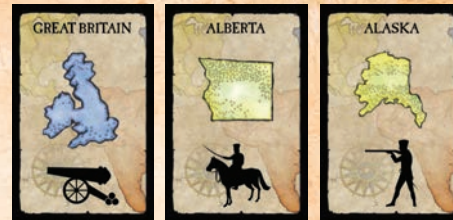
1 each of the 3 troop designs

For quick reference, keep the sets of traded-in cards faceup under the edges of the gameboard to keep track of how many sets have been traded in. (See example to the right.)