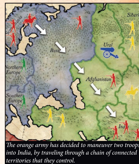
The orange army has decided to maneuver two troops into India, by traveling through a chain of connected territories that they control.

Don't forget: in moving your troops from one territory to another, you must leave at least one troop behind to stand guard.